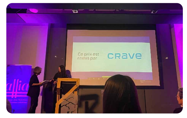
Bell Media recognizes the importance of women's inclusion and participation. Bell Media's role as the year-round lead partner of the Alliance des femmes des industries créatives (Allia) reflects our commitment to the inclusion and contribution of women working in the field. Allia promotes the talent, creativity and innovation of women and emerging artists in the industry.