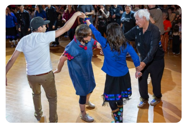
Northwestel partners with the Adäka Cultural Festival to celebrate the culture of Indigenous people across the Yukon and in other parts of Canada. Northwestel believes strong connections build stronger communities. The annual Adäka theme "Northern Connections" event is especially important to the company. Adäka provides Indigenous artists with exceptional opportunities for artistic development and mentorship, while shining a light on their creativity for local, national and international audiences.