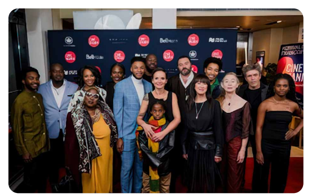
Cinemania is a francophone film festival in Montréal. Since 1995, the festival has been an active participant in the dynamism and cultural influence of Québec. The films come from Québec, France, Luxembourg, Senegal, Belgium, Algeria, Morocco, Ivory Coast, Switzerland, and Central Africa.