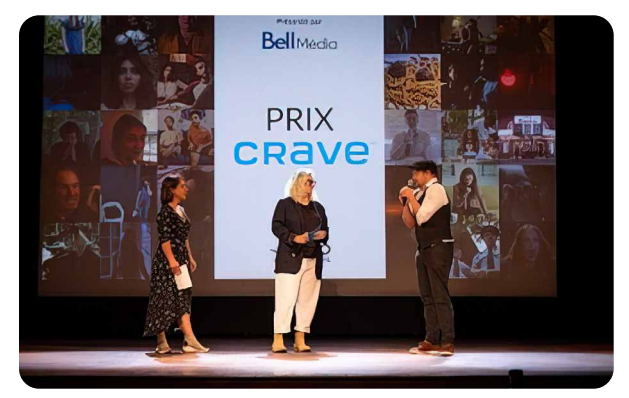
Bell Media supports and encourages the next generation of filmmakers. For many years, we have been an annual supporter of Kino. This organization supervises and supports the creation of short films. It also supports the community of short film creators, helping to accelerate the development of individual artists, and to promote them and their work.