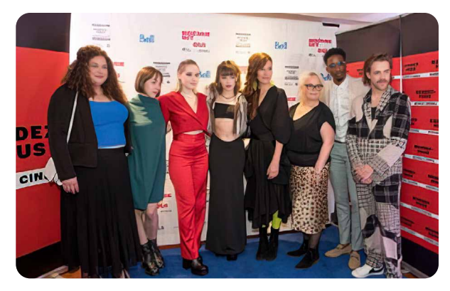
The Rendez-vous Québec Cinéma is the only film festival entirely dedicated to Québec cinema. Operating for more than 40 years, the festival offers the widest range of cinematographic genres and approaches. It brings together the works of both emerging and established filmmakers.