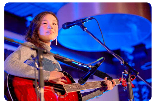
The Alianait Arts Festival once again took place under their signature big top tent in Iqaluit, showcasing Nunavut artists and their northern stories, experiences, and culture. Since 2005, the Festival has been a world-class talent showcase for Inuit and other circumpolar artists. As a festival partner for more than a decade, Northwestel is proud to continue its longstanding support of the arts that to bring us together.