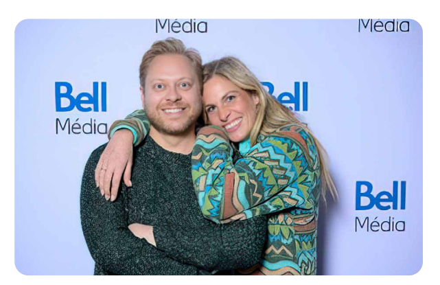
The Abitibi-Témiscamingue International Film Festival presents more than 100 productions from over 30 countries. Short, medium and feature length films, documentaries, animation, and fiction films are screened.