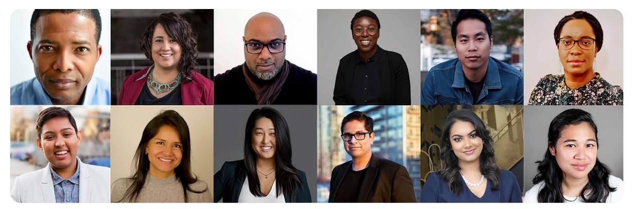
2022 Reelworld Producer Program participants Bell Media and <u>Reelworld Film Festival and Screen Institute</u> creating the Reelworld Producers Program for Black, Indigenous and Persons of Colour (BIPOC) candidates.