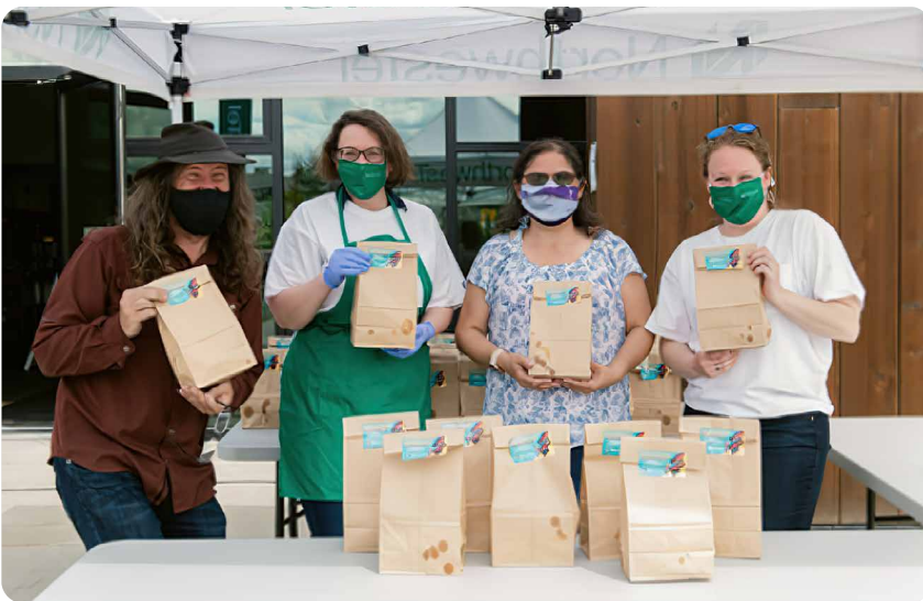
Northwestel Solstice Feast.

At Bell, we also engage in meaningful dialogue with Indigenous communities to mitigate local concerns about our network. For example, our network infrastructure environmental evaluation program is embedded directly in our environmental management and review system in order to minimize the negative impacts of network projects on the environment.