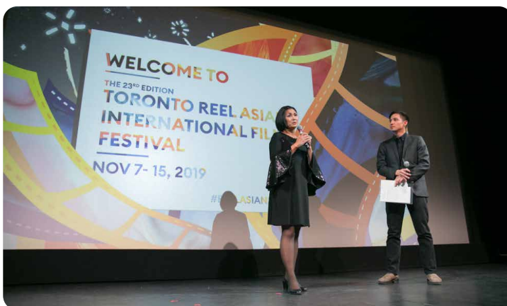
Left: Toronto Reel Asian International Film Festival.