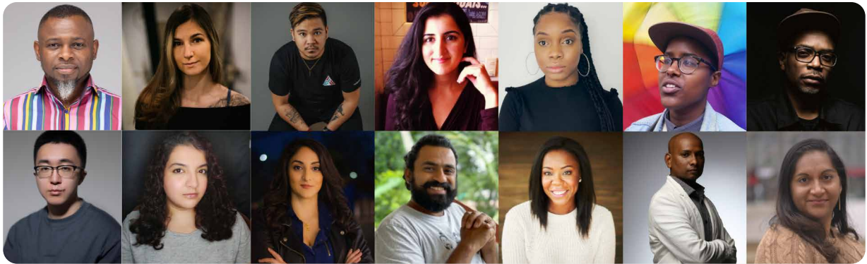
Top: Reelworld of participants of the Producers Program.

Bell Media offers inclusive programming across multiple media platforms to celebrate Indigenous culture and history, including on its video streaming service Crave. We also support Canadian film festivals that highlight the work and stories of Indigenous communities and racially diverse people, including the ImagineNATIVE Film Festival, the Reel World Film Festival and the Toronto Reel Asian International Film Festival.