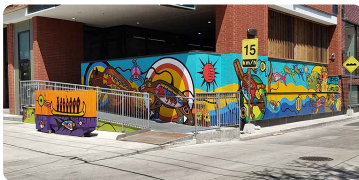
Bell Box Murals project, Toronto.

At Bell, we recognize the injustices of the past and we are taking steps to improve the inclusion and engagement of Indigenous peoples in economic development projects and through their representation at Bell by expanding training, support in mental health, skills development and job opportunities, and in educating our team members about Indigenous issues.