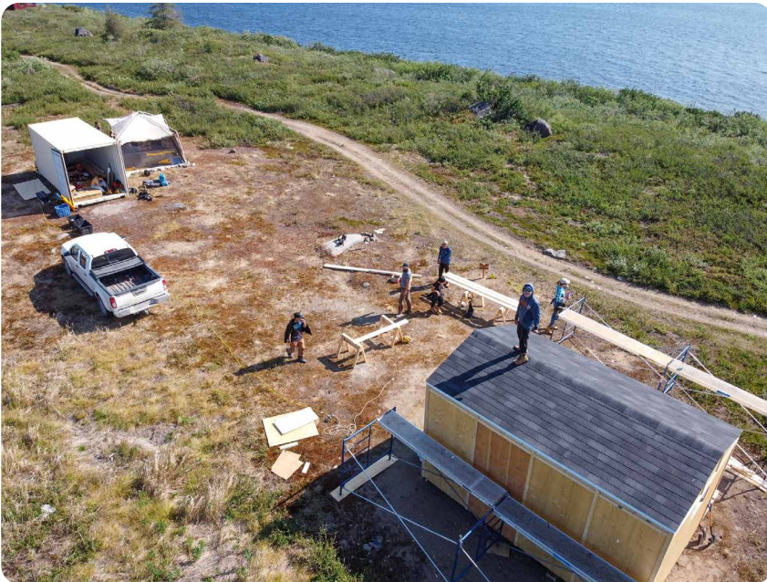
Jeunes Karibus Ikaartuit Cabin Project.

Through their Diversity Fund project, ᓄᓐᓐᓐᓐᓐ I Nurrait I Jeunes Karibus is working to support the mental health and wellness of Indigenous youth. Their Ikaartuit Cabin Project helps young people aged 14 to 19 and in situations of psychosocial vulnerability build strategies to cope with their mental health. In 2021, ten young people worked together over three weeks to build a cabin near Barrel Beach in Kuujjuaq, Québec. Youth are also engaged in traditional activities, including fishing and mussel picking, with local knowledge-holders and attend workshops on communication and team spirit.